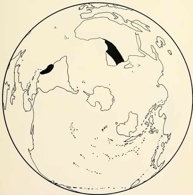
Fig. 5. Distribution of the living members of the family Pipidae.

Pelobatidae. The following three subfamilies of pelobatids are recognized: Pelobatinae, which includes one genus in Europe and northern Africa and another in North America; Pelodytinae (sometimes recognized as a separate family) with a single genus in Eu-